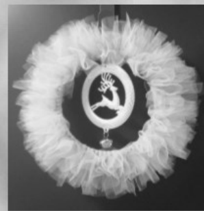
Wreaths by: Niki Yuchasz

Wreaths are examples and not the exact designs for the wreath workshop.